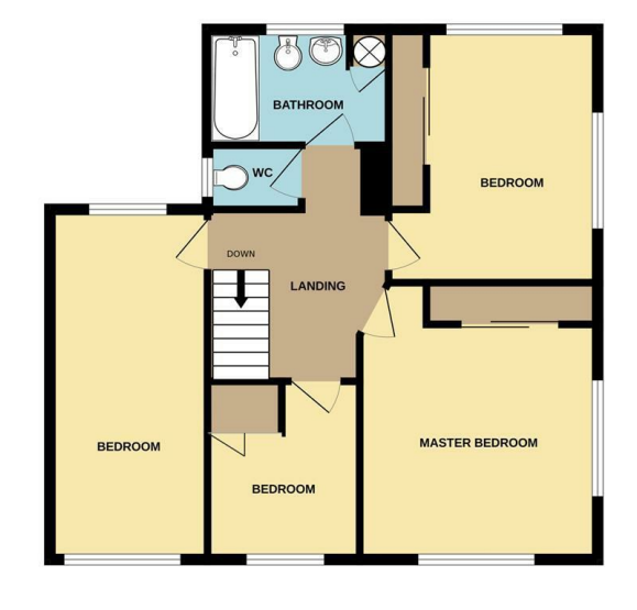
1ST FLOOR 676 sq.ft. (62.8 sq.m.) approx.