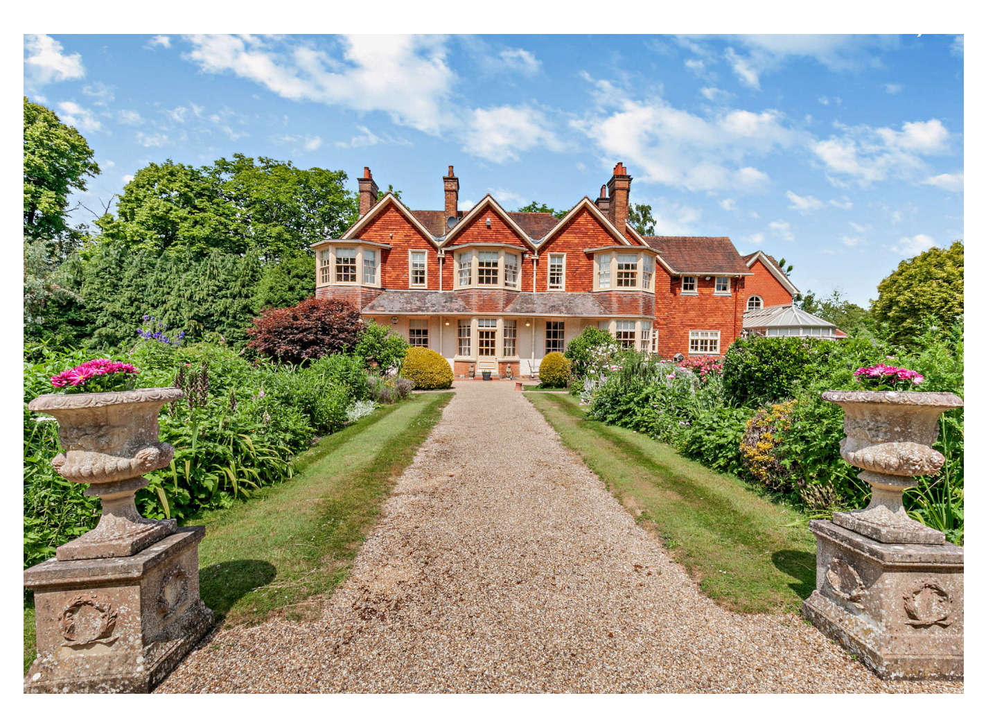
An imposing detached 7 bedroom Edwardian residence, with self-contained suite and 4 room entrance Lodge, set in wonderful gardens and grounds immediately adjacent to golf course and extending to about 3.65 acres.

Entrance Porch • Reception Hall • Drawing Room • Dining Room • Kitchen-Breakfast Room • Lift to first floor • Garden Room • Snug • Study Utility Room • WC • Boiler room • Cellar