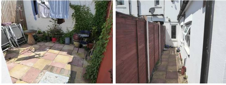
Paved patio area