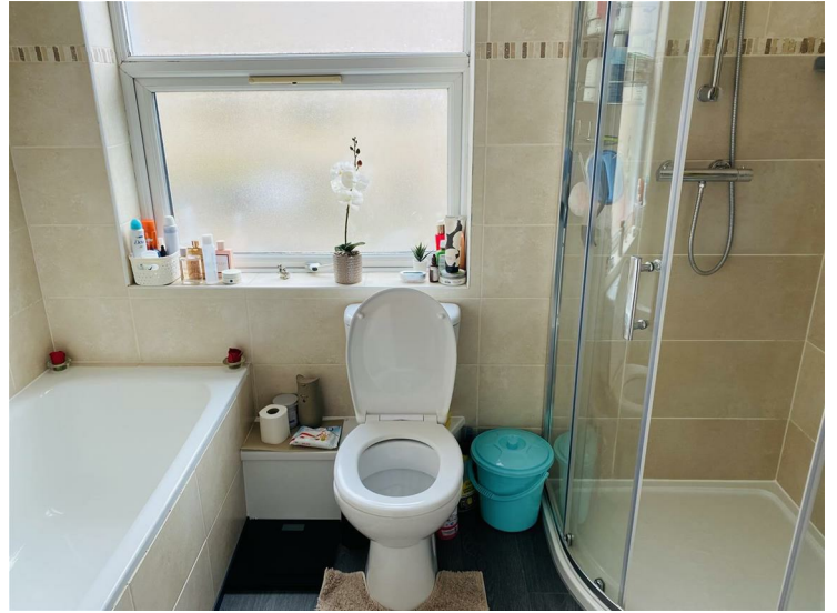
Modern suite comprising tiled enclosed bath with mixer tap, wash hand basin with mixer tap and vanity unit below, tiled enclosed shower cubicle with wall mounted shower unit, tiled walls, front aspect double glazed frosted window, heated towel rail.