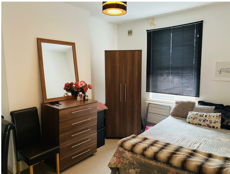
Rear aspect double glazed window, radiator.