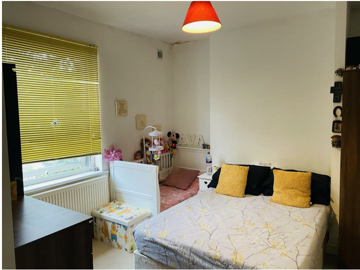
Front aspect double glazed window, radiator, power point.