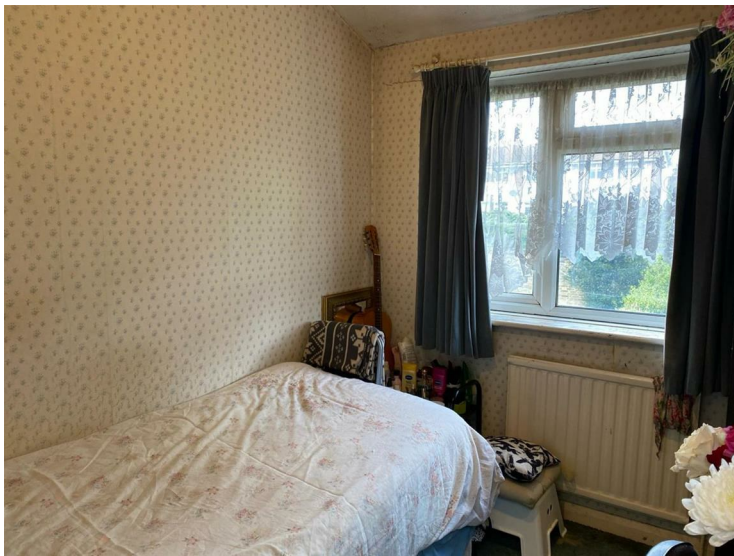
Rear aspect double glazed window, radiator.