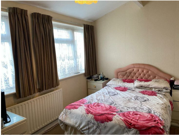
Front aspect double glazed window, radiator, two storage cupboards.