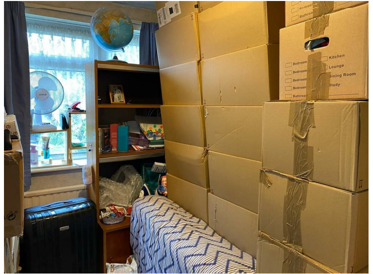
Rear aspect double glazed window, radiator.