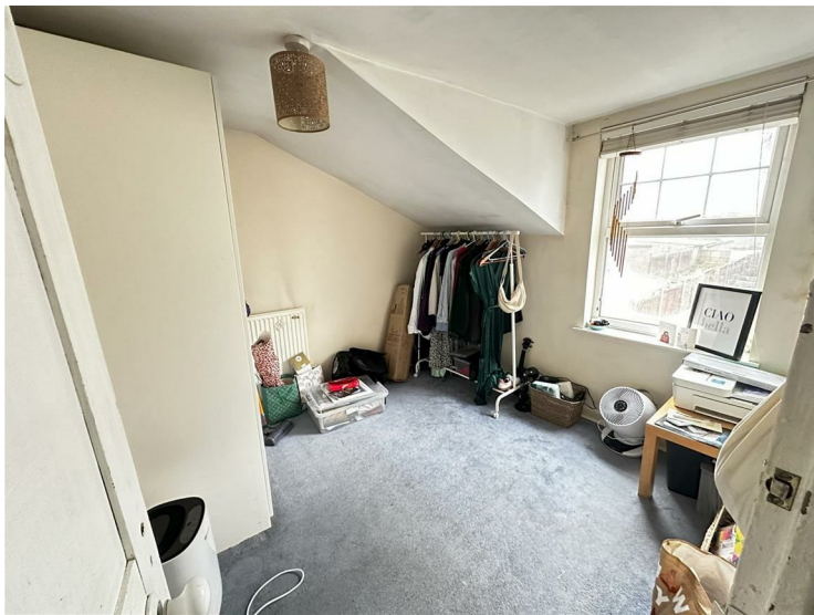
Rear aspect double glazed window, radiator, cupboard.