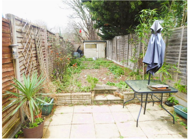
Paved patio area, timber shed.