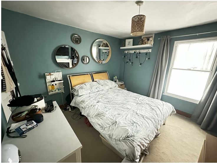
Front aspect double and secondary glazed window, radiator, access to loft.