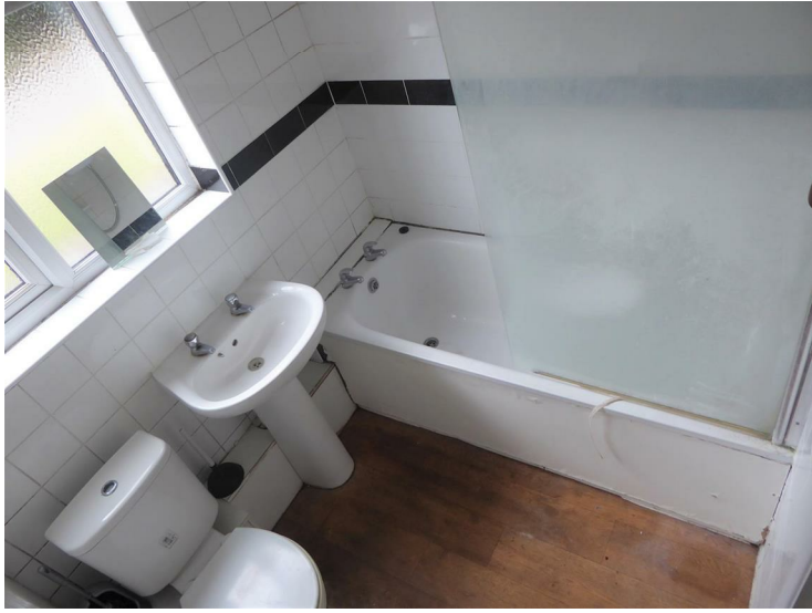
White suite comprising panel enclosed bath, pedestal wash hand basin, low level w/c, part tiled walls, double glazed frosted window.