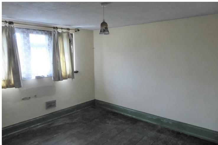
Front aspect window, stripped floorboards.