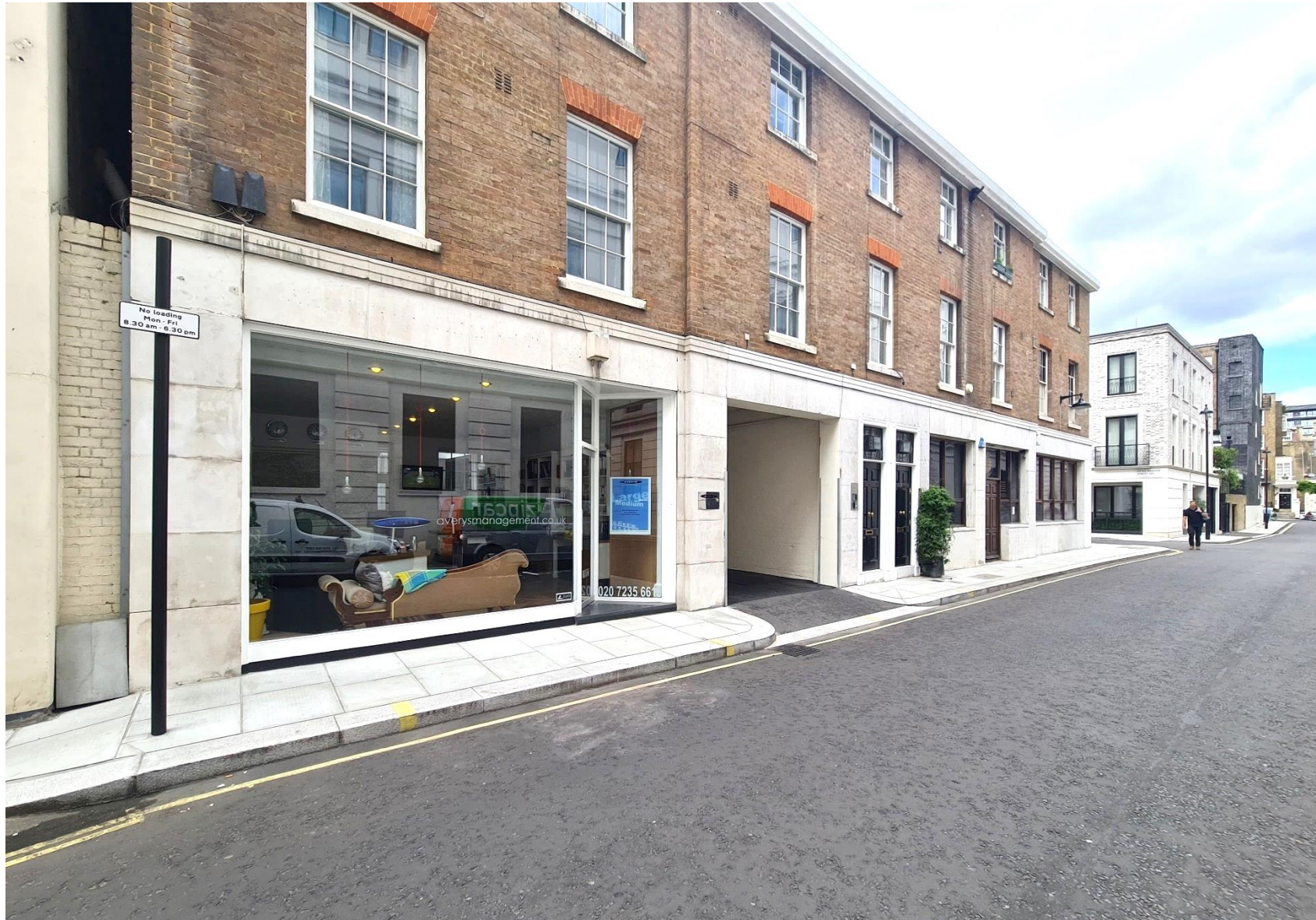
Ground floor commercial premises, 3 Chester Mews, London SW1X 7AH