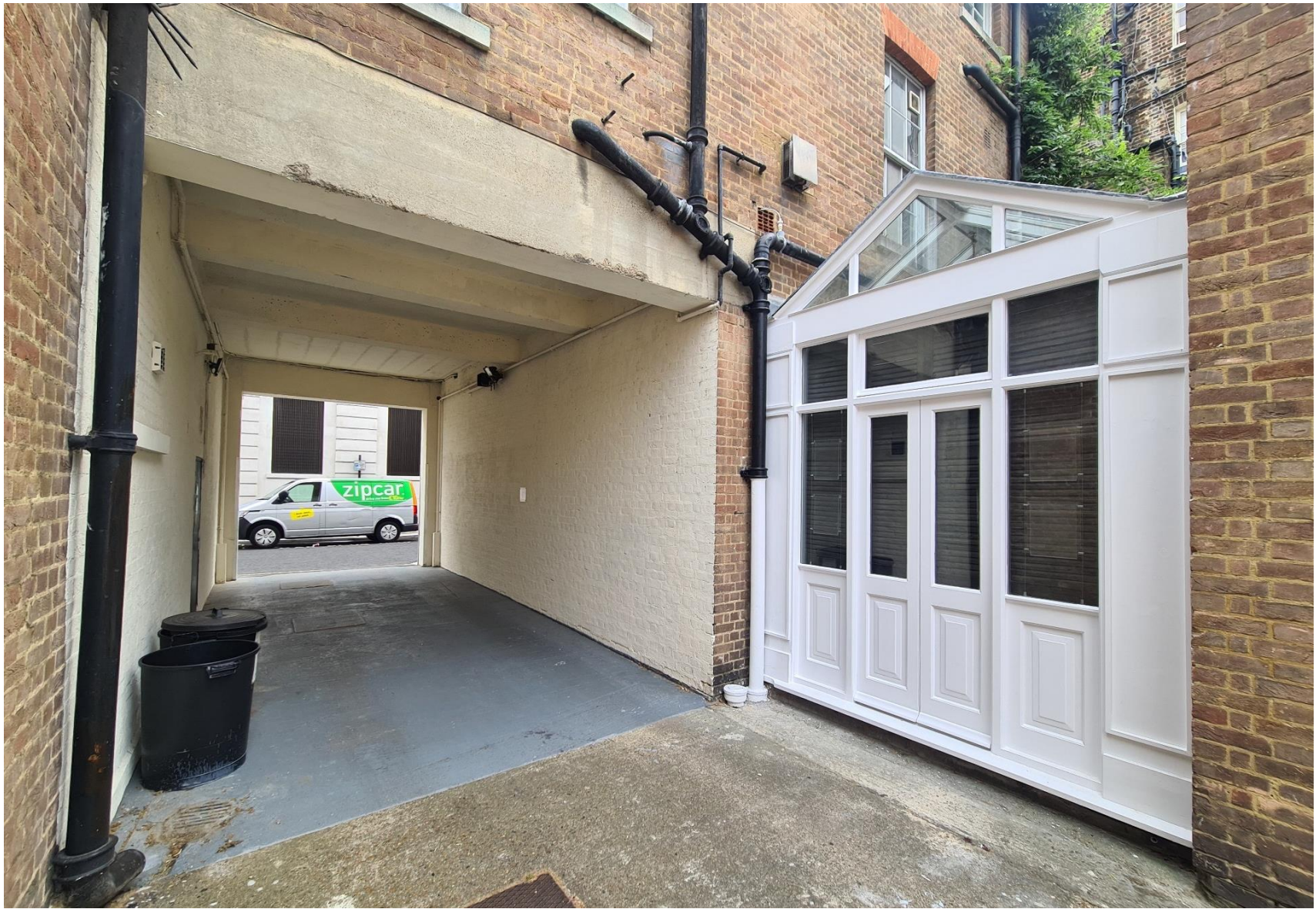
Ground floor commercial premises, 3 Chester Mews, London SW1X 7AH