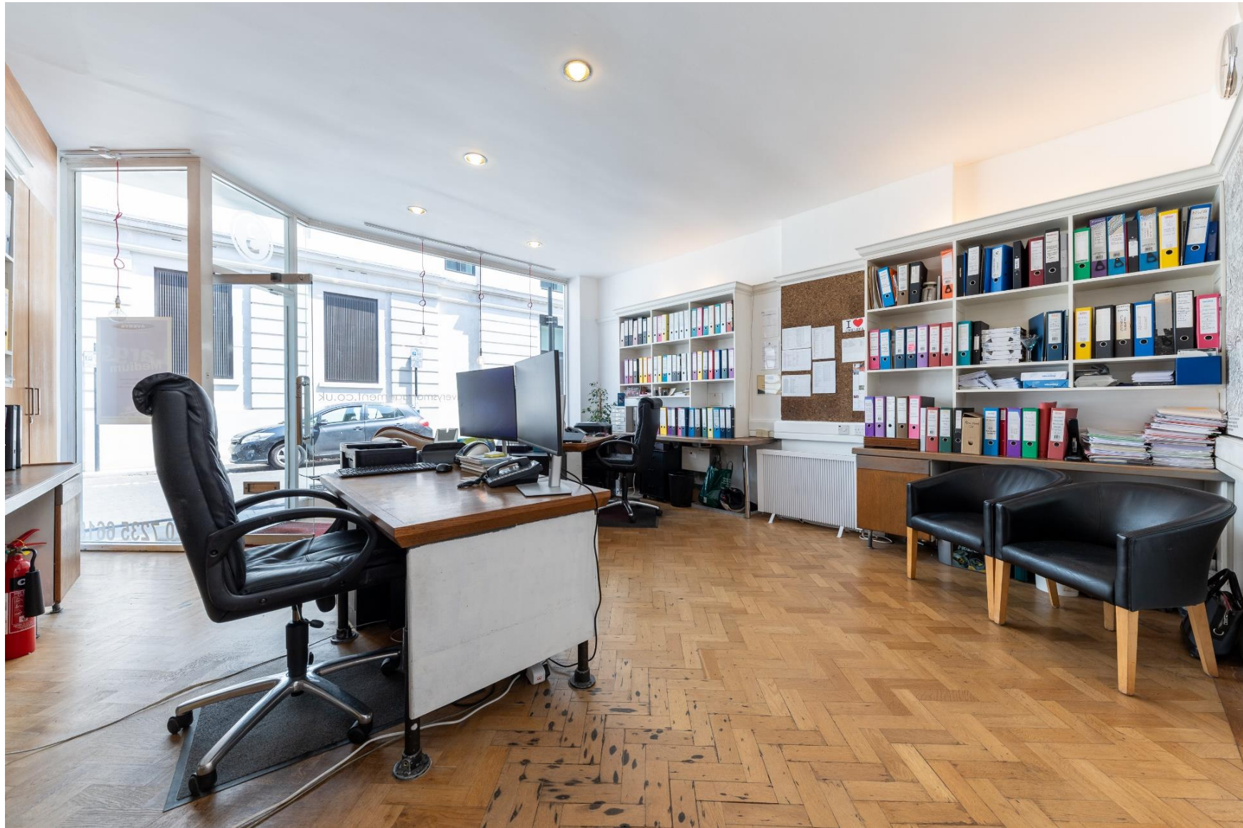
Ground floor commercial premises, 3 Chester Mews, London SW1X 7AH