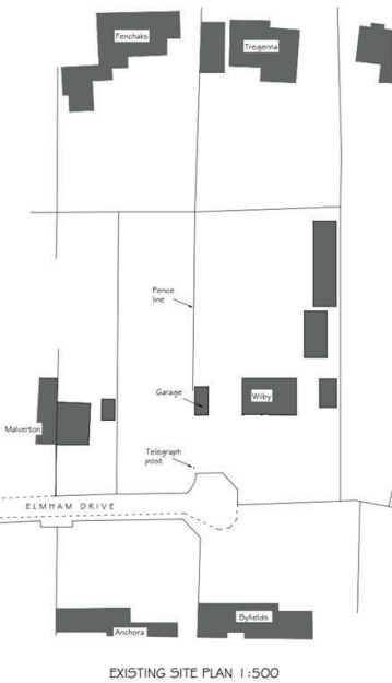
EXISTING SITE PLAN 1:500