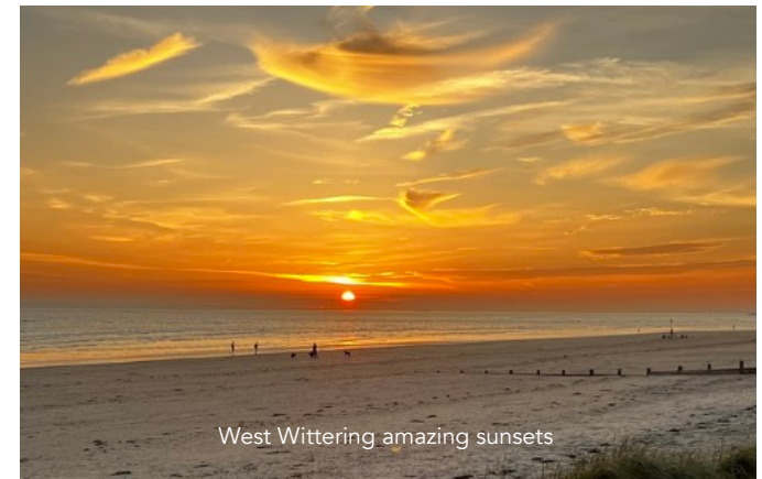
West Wittering amazing sunsets

LOCAL AUTHORITY: Chichester Council 01243 785166