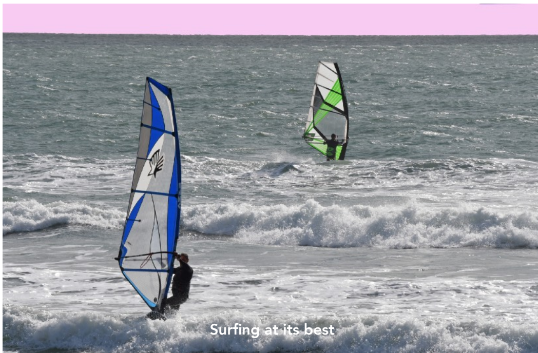
Surfing at its best

A stunning and superbly appointed individually designed detached house with bright and particularly versatile accommodation, comprising 6 bedrooms, 2 bathrooms, spectacular double height vaulted ceiling sitting/dining room open plan snug, private gardens well located only a short walk to an wonderful sandy beach.