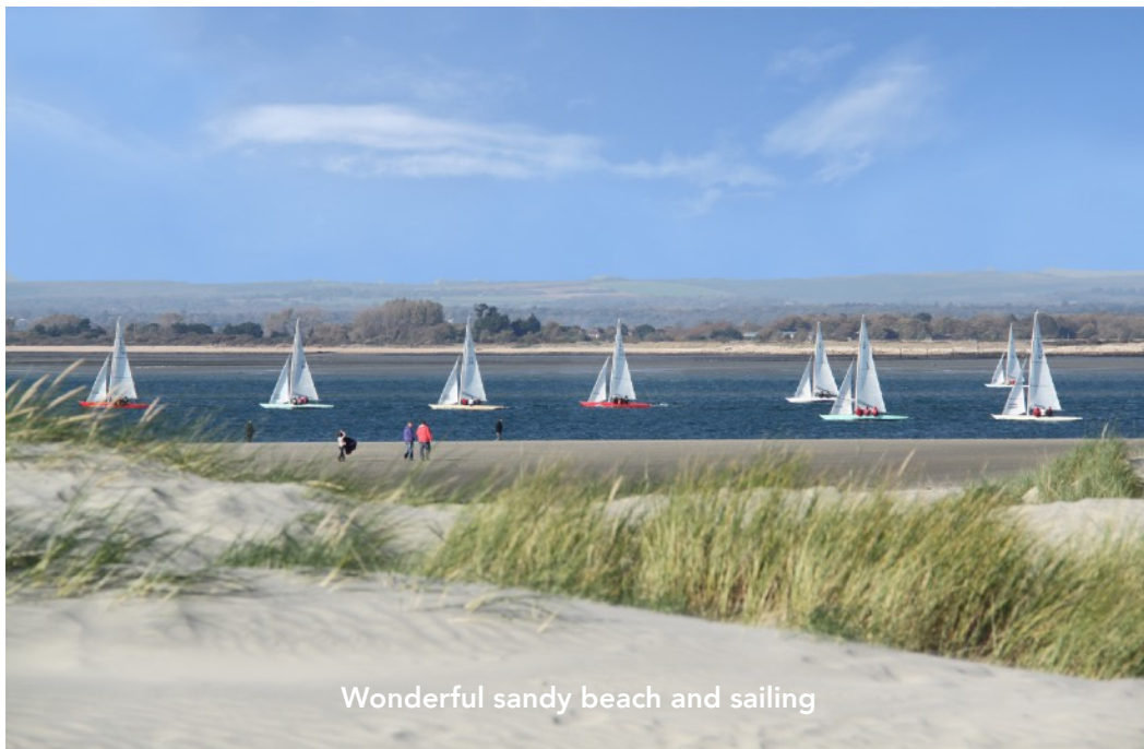
Wonderful sandy beach and sailing