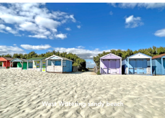
West Wittering sandy beach