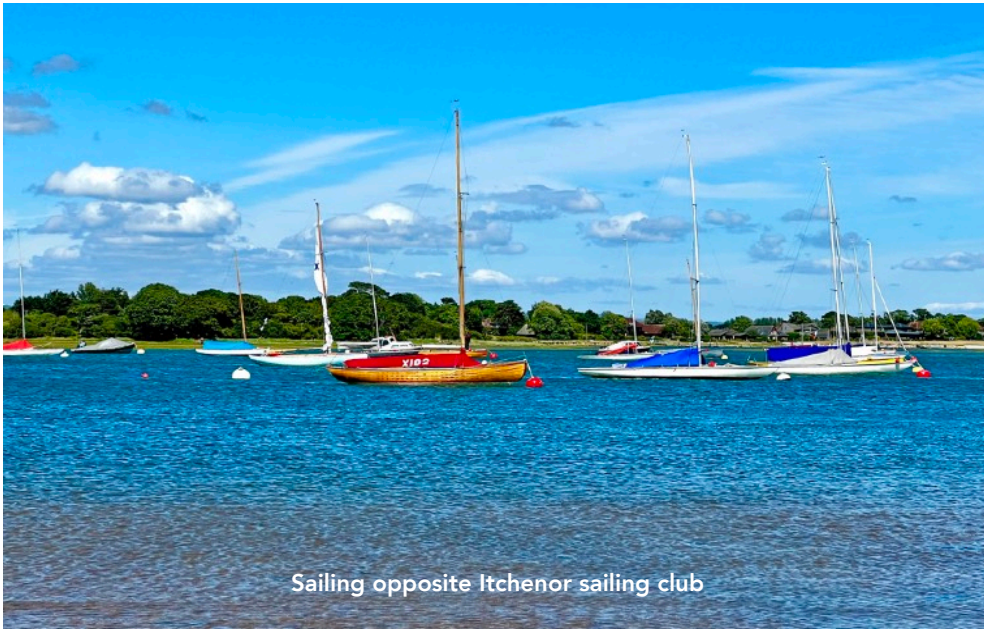
Sailing opposite Itchenor sailing club

The Cottage is a beautifully appointed charming detached period cottage with spacious accommodation that combines contemporary lifestyle with character features, comprising: 3 bedrooms, 2 bathrooms, 2 receptions and stunning kitchen/dining room, delightful gardens and grounds, located in a highly sought after sailing village with amazing walks that virtually emanate from the doorstep across stunning countryside leading to the harbour.