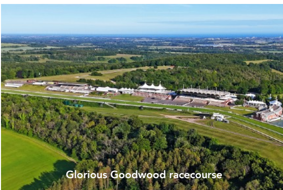
Glorious Goodwood racecourse