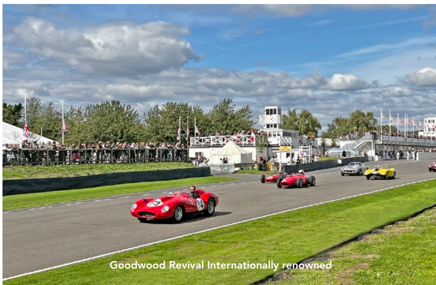
Goodwood Revival Internationally renowned