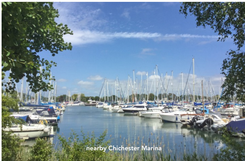
nearby Chichester Marina

An excellent opportunity to acquire industrial premises set within delightful grounds with a rear aspect overlooking farmland, formerly a dog training venue, incorporating a small Cafe and outbuildings, providing potential business opportunities, in all set in 3.1 acres, located about 2 miles south of the city and near Birdham and Chichester marinas.