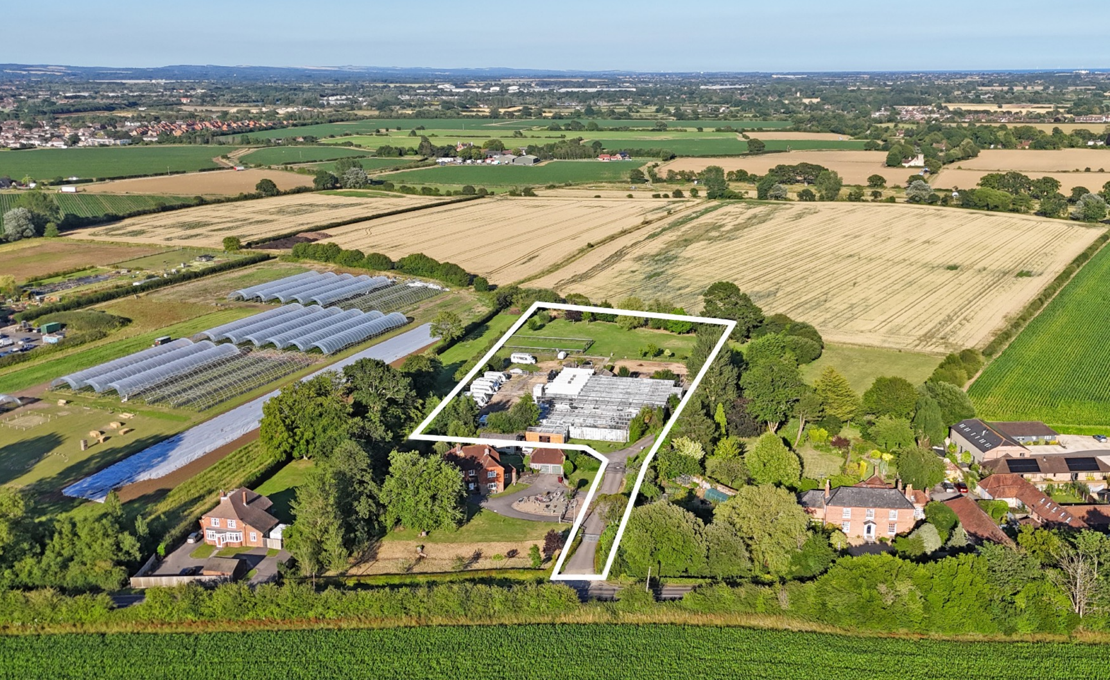
Former Dog Training centre (Industrial Premises For Sale or may Let) Birdham Road, Appledram, Chichester, West Sussex, PO20 7EQ