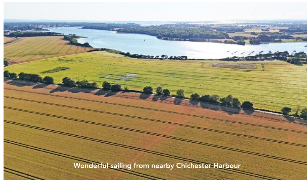
Wonderful sailing from nearby Chichester Harbour