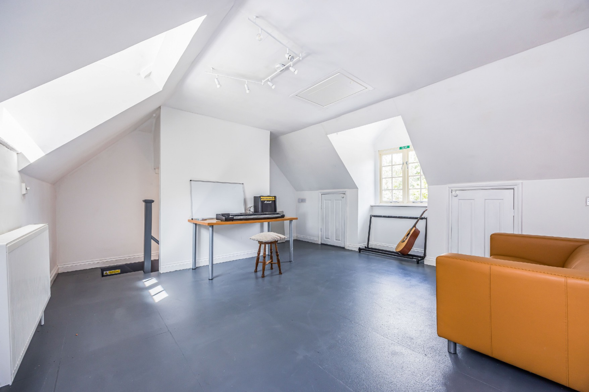
Studio above the double garage with further potential