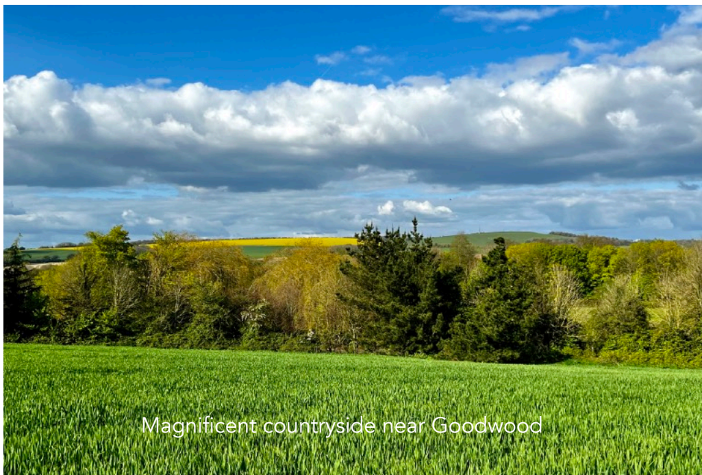
Magnificent countryside near Goodwood