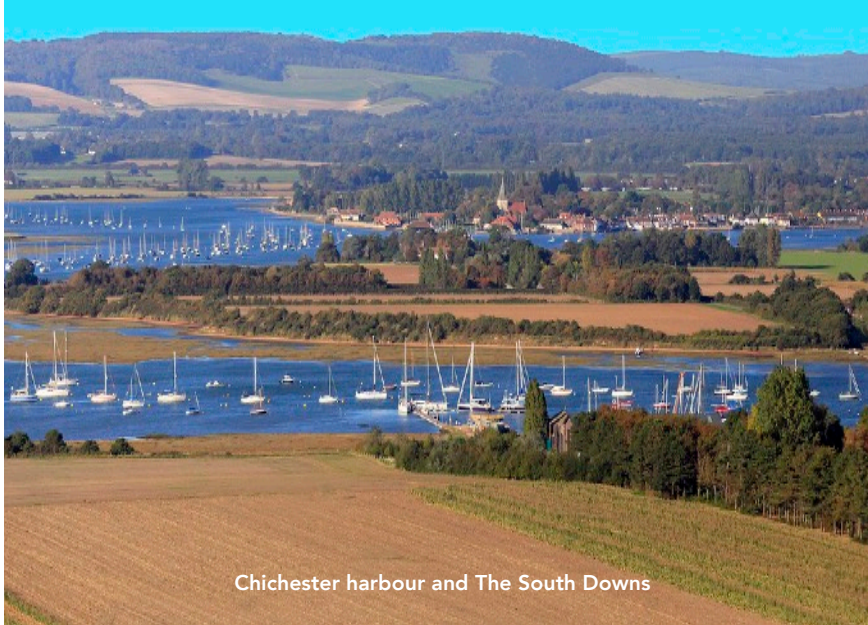
Chichester harbour and The South Downs