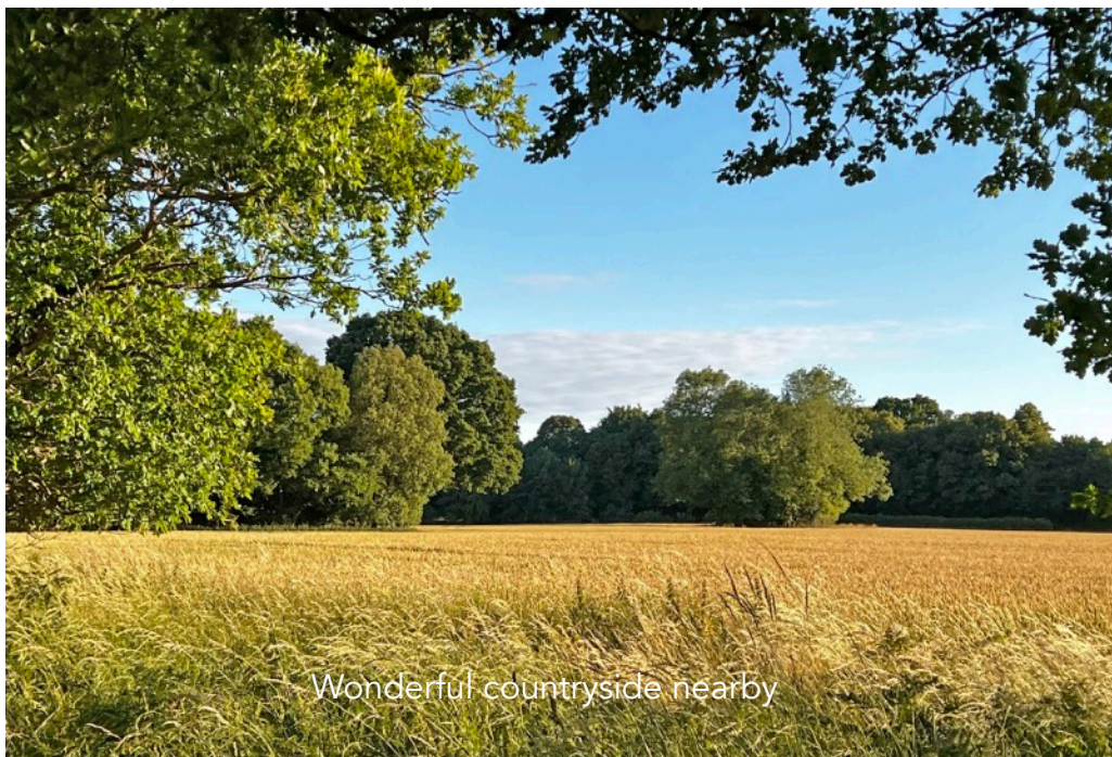
Wonderful countryside nearby