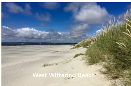
West Wittering Beach