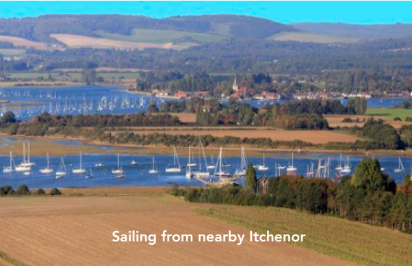
Sailing from nearby Itchenor