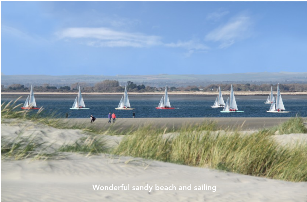
Wonderful sandy beach and sailing