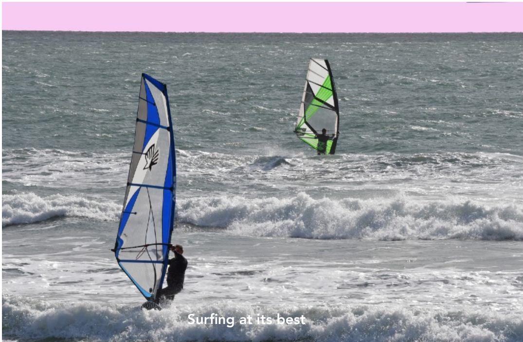
Surfing at its best

A beautifully presented seafront detached house of exceptional charm and character, incorporating classic converted railway carriages and spacious accommodation comprising: 4 bedrooms, 2 bathrooms, ground and first floor sitting rooms and a balcony with breathtaking south aspect views out to sea and the Isle of Wight with a garage, two gardens and direct access to the beach.