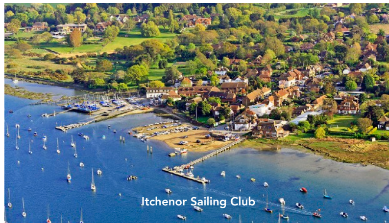
Itchenor Sailing Club