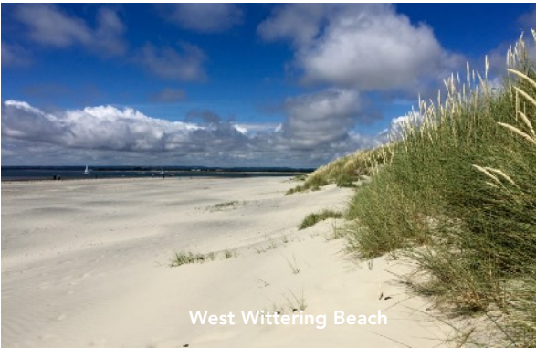
West Wittering Beach