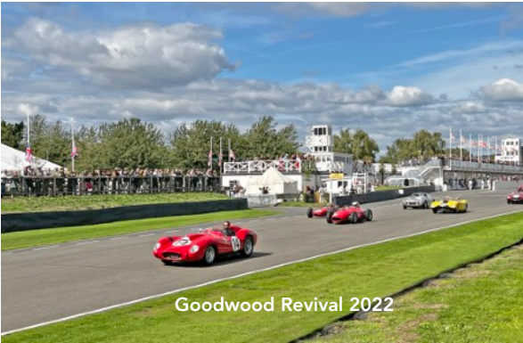
Goodwood Revival 2022