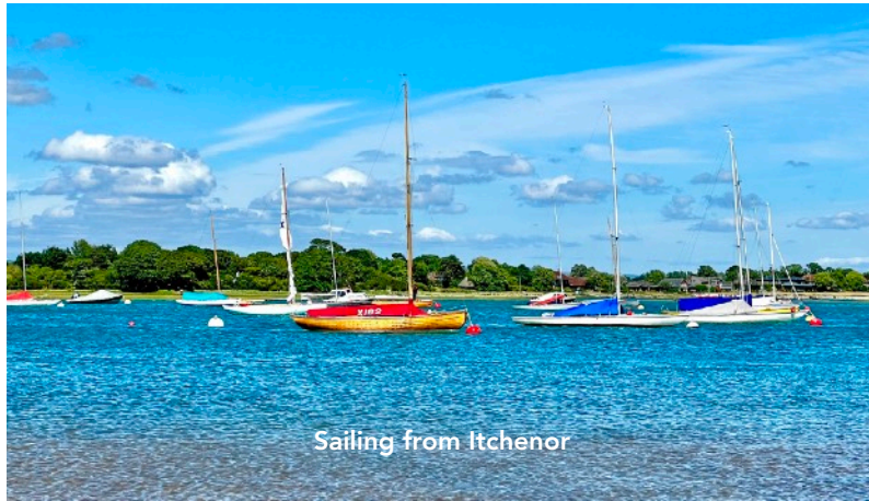
Sailing from Itchenor