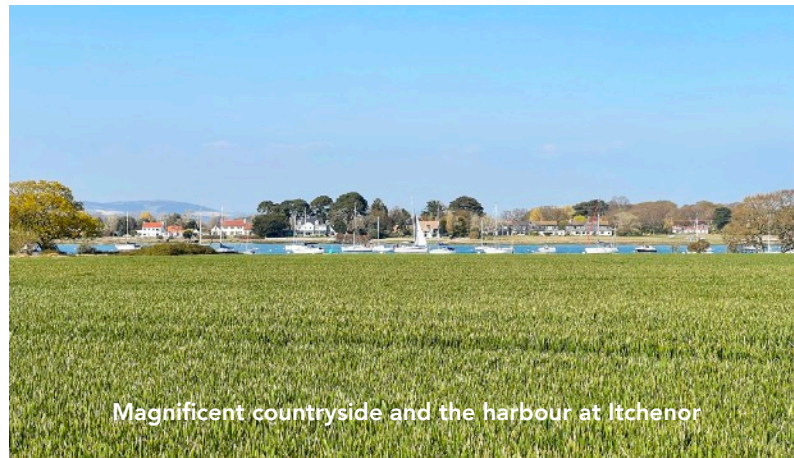
Magnificent countryside and the harbour at Itchenor