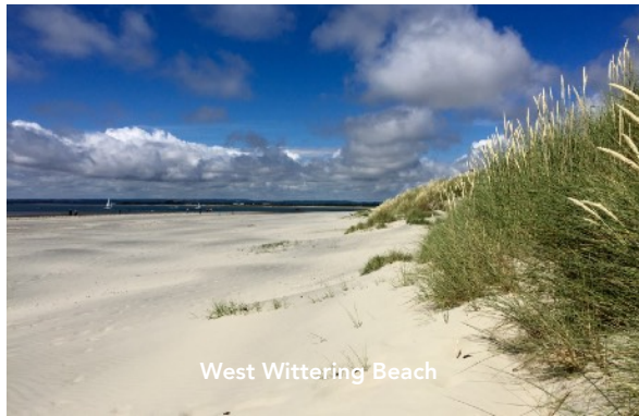
West Wittering Beach