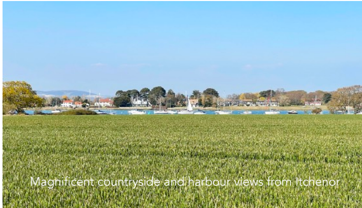
Magnificent countryside and harbour views from Itchenor