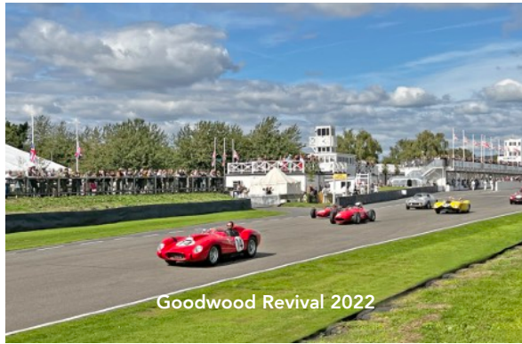
Goodwood Revival 2022