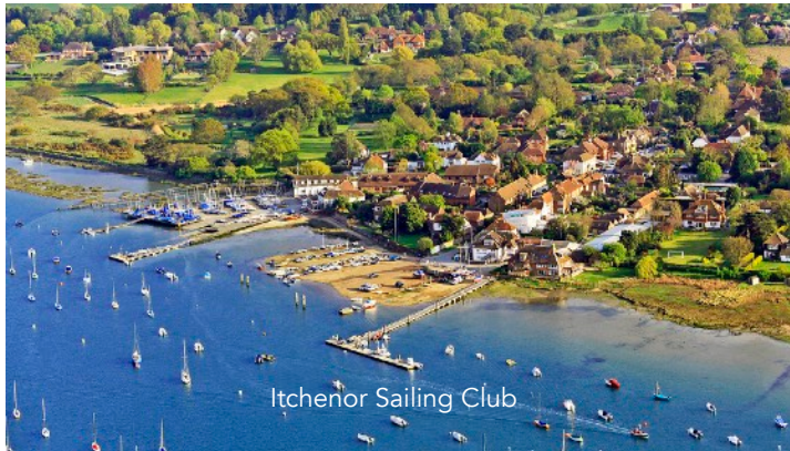
Itchenor Sailing Club