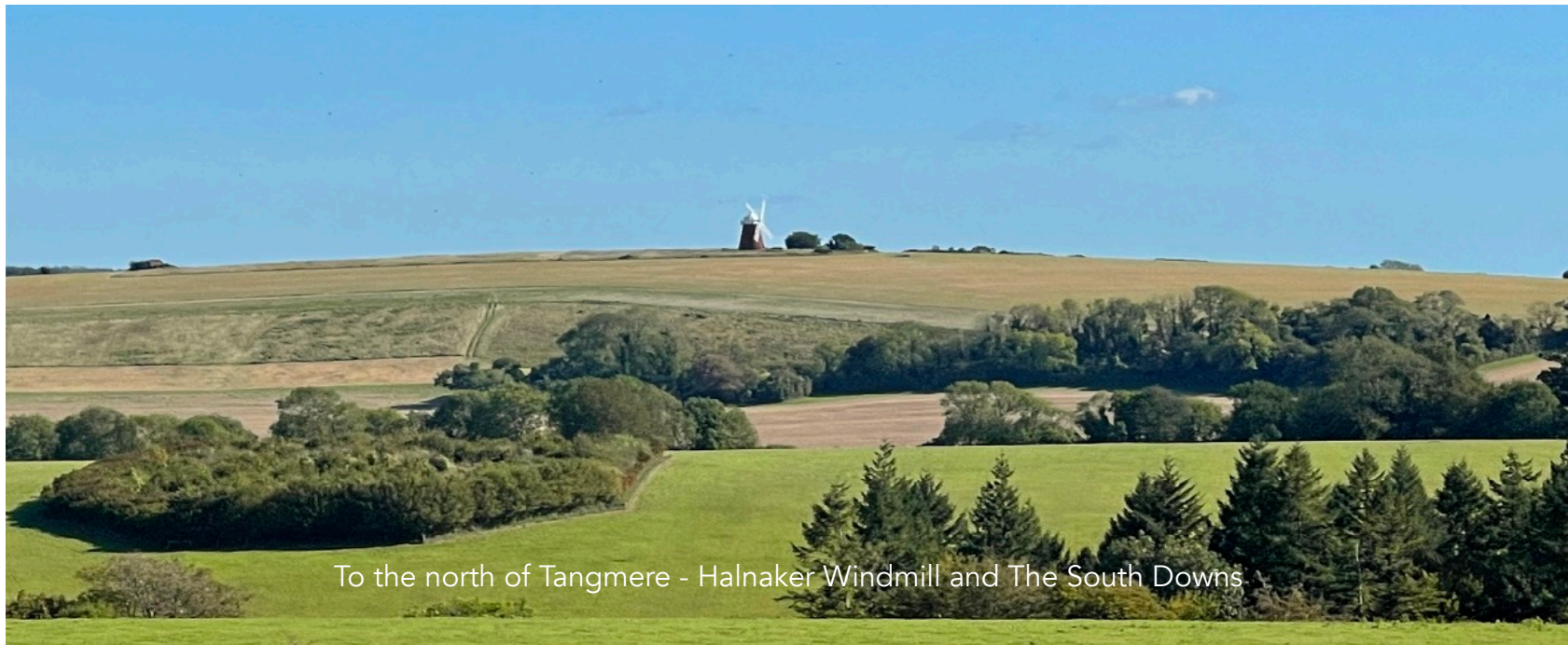
To the north of Tangmere - Halnaker Windmill and The South Downs

A handsome modern Georgian style detached house of elegant proportions with impressive accommodation of approx. 2,790 sqft including 4 double bedrooms, 2 bathrooms, dressing room and 3 receptions, located in the heart of a desirable village near Goodwood, set in beautiful south and west aspect gardens and grounds of about 0.44 acres