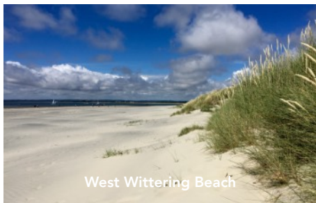
West Wittering Beach