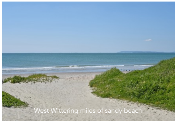
West Wittering miles of sandy beach