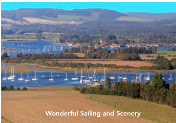
Wonderful Sailing and Scenery