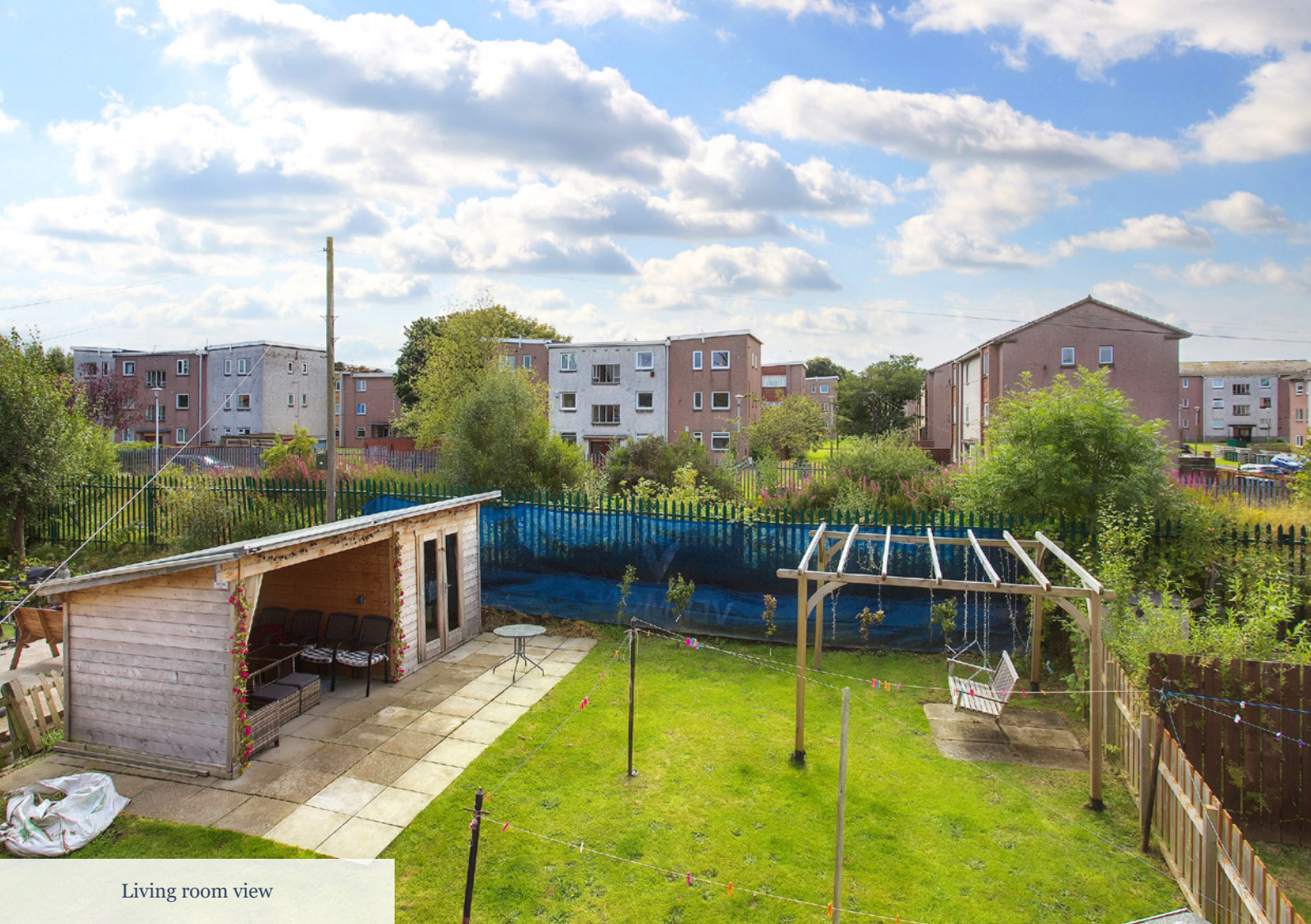
Living room view