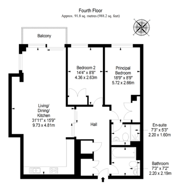
Total area: approx. 91.8 sq. metres (988.2 sq. feet)