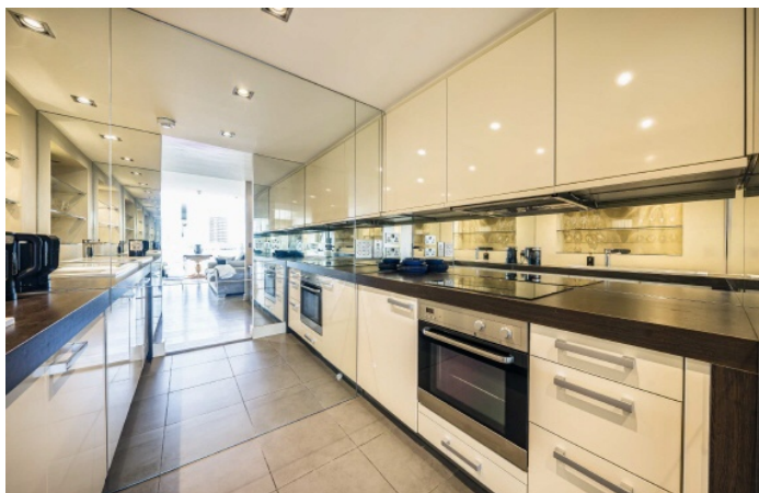
Empire Square West, SE1