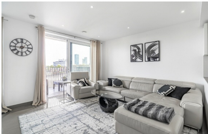
Blackfriars Road, SE1