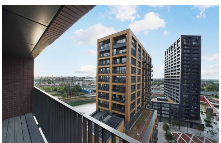
Lyell Street, E14