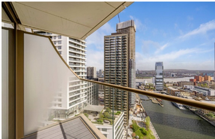
Park Drive, E14