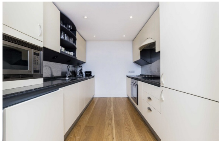
Westferry Circus, E14