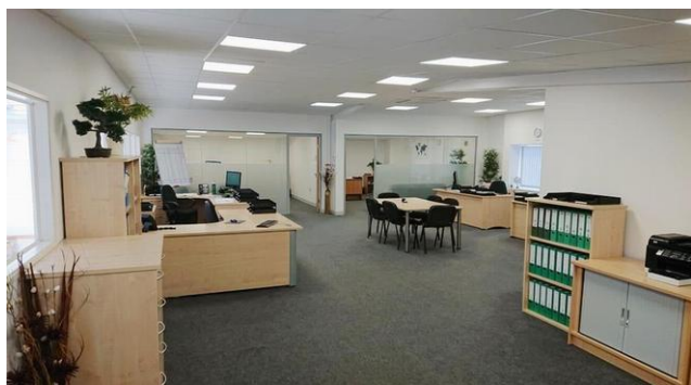
Photographs taken prior to current tenant's occupation.

Approximately 1.5 miles from J13 of the M3 and 2.5 miles from J5 of the M27, Chandlers Ford Estate is one of the premier estates in the Southampton area. Eastleigh Town Centre is approximately 1 mile to the East and Southampton Town Centre is approximately 5 miles to the south. The area benefits from excellent communications infrastructure and is well served with motorway, rail, shipping and airport facilities.