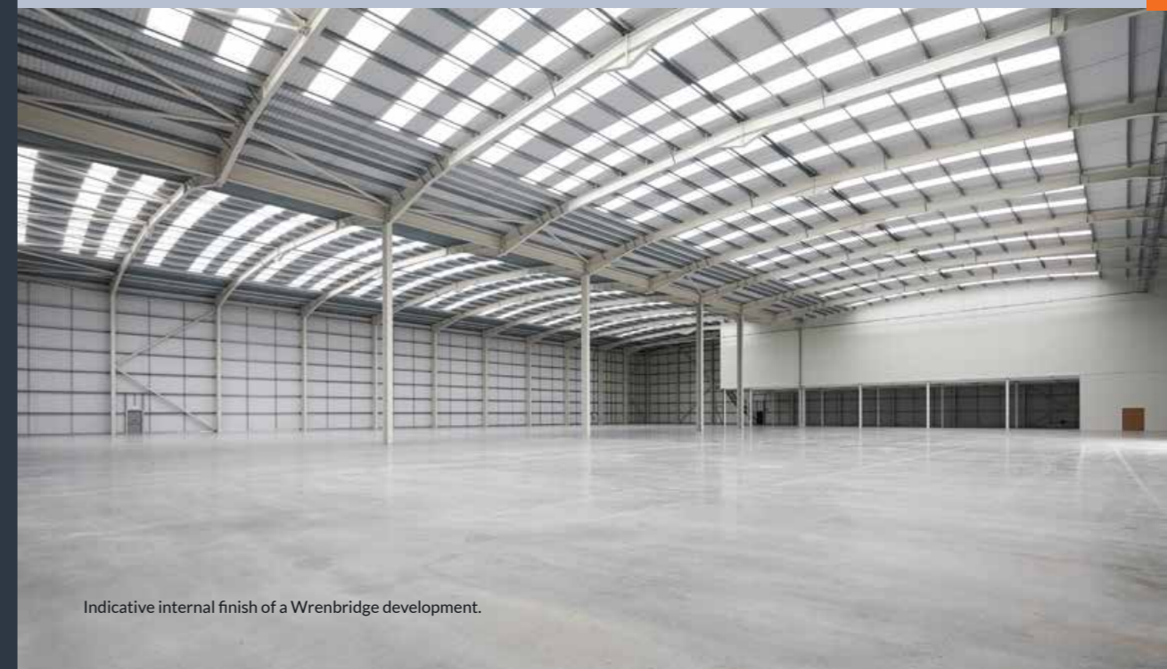
Indicative internal finish of a Wrenbridge development.

All areas are approximate and provided off plan on a Gross External basis. Buildings will be subject to measurement upon completion.