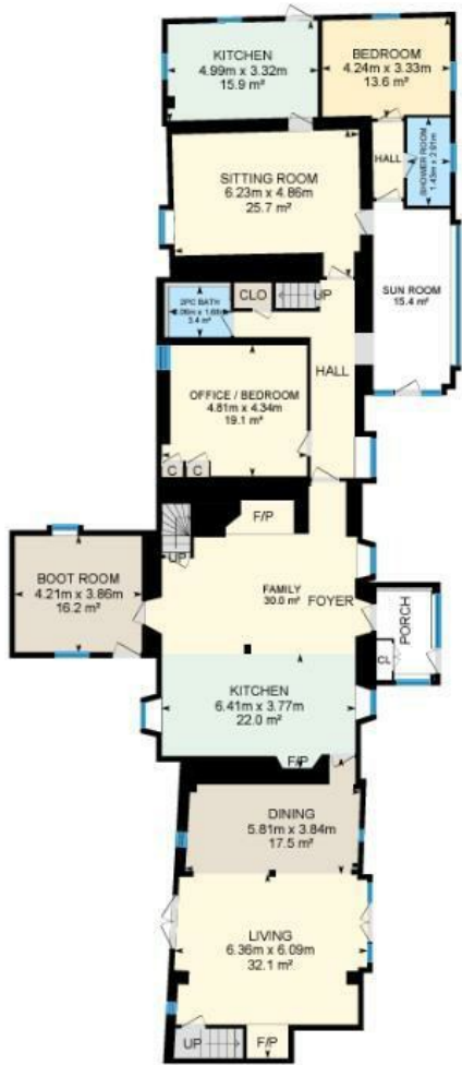
Ground Floor Interior Area 247.57 m 2

Main Building: Total Interior Area Above Grade 424.48 m 2