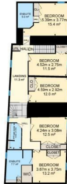
1st Floor Interior Area 135.38 m 2