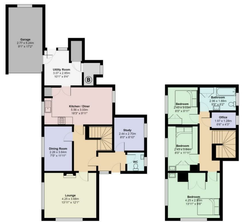
The Presbytery, Tredegar

Total Area: 145.6 m 2 ... 1568 ft 2 All measurements are approximate and for display purposes only.