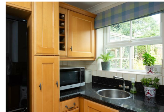
Back Lane, Wigginton, York Guide Price £585,000