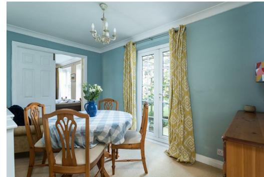
Back Lane, Wigginton, York Guide Price £585,000

A spacious, detached family home in this highly sought-after village location by Wigginton duck pond benefiting from four double bedrooms and wrap around gardens with substantial garden to the rear.