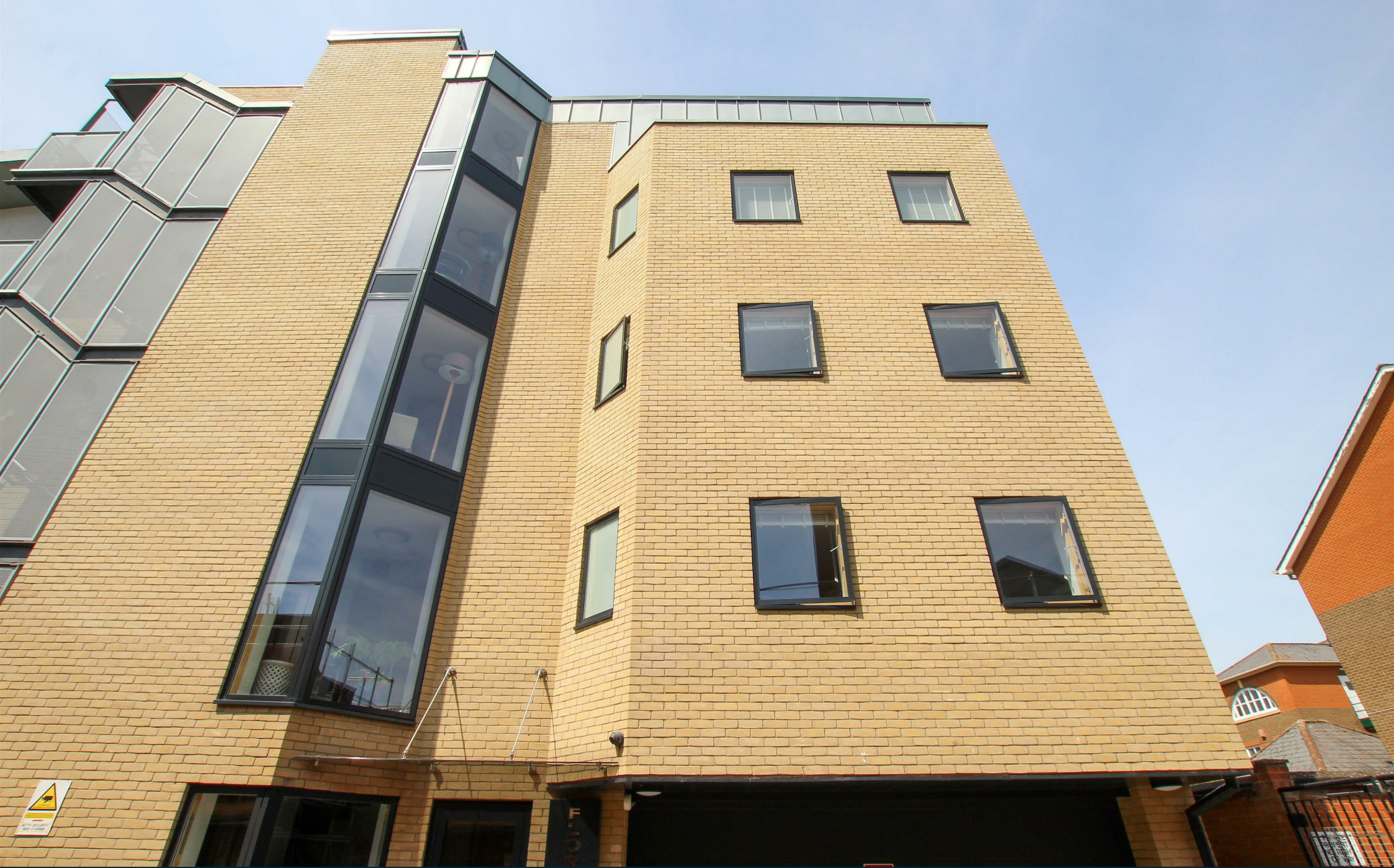
Florian House, Severn Place, Cambridge, CB1 1AQ