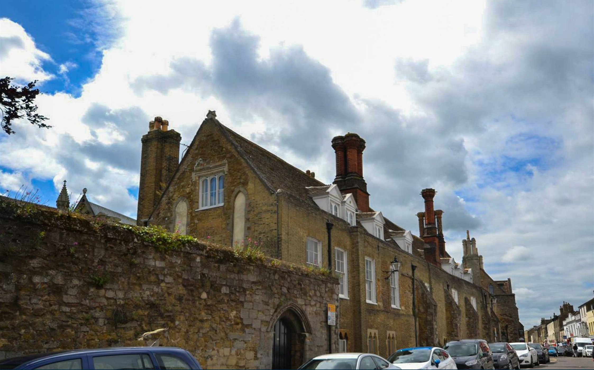
The Almonry, Ely, CB7 4JU