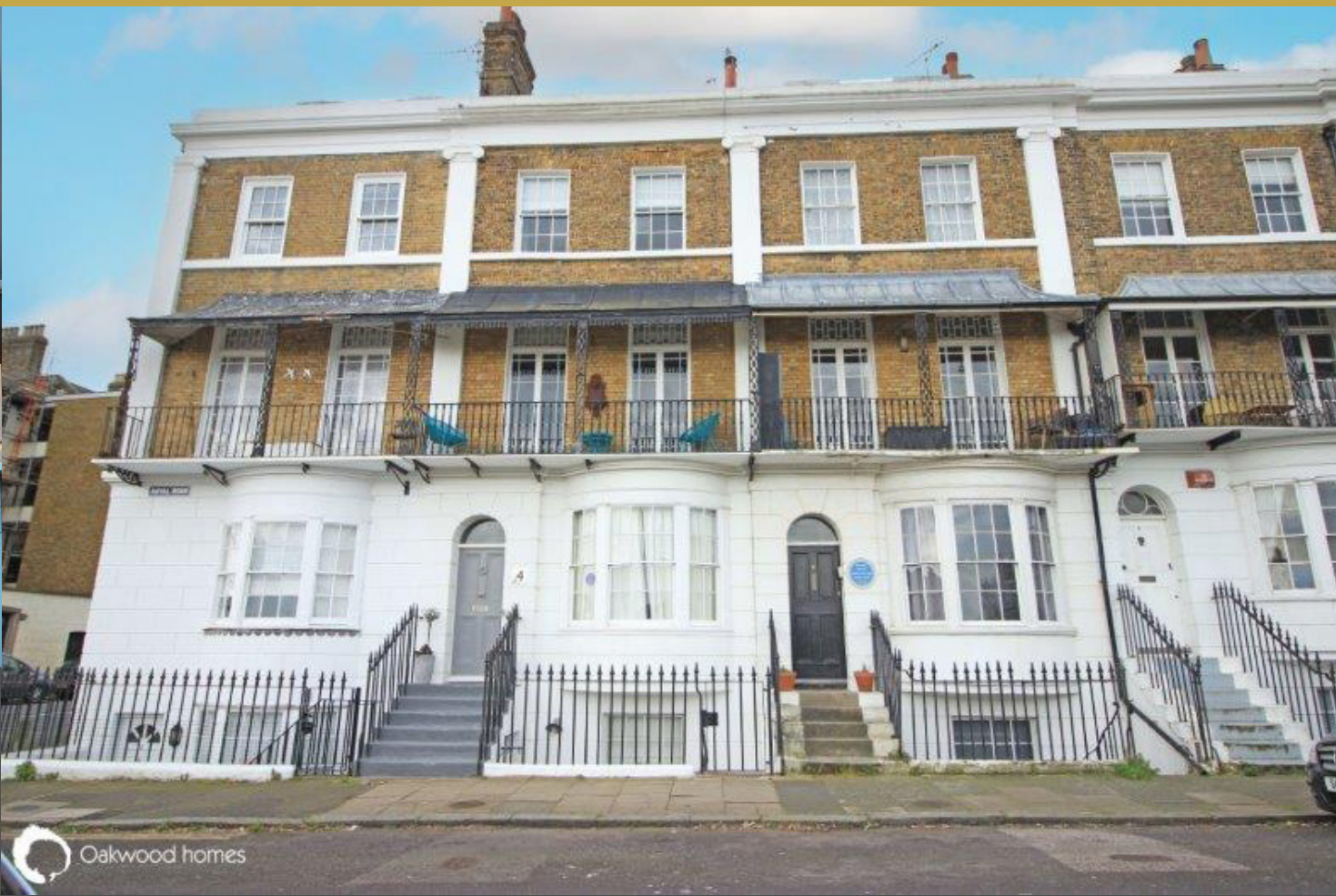
4 ROYAL ROAD RAMSGATE