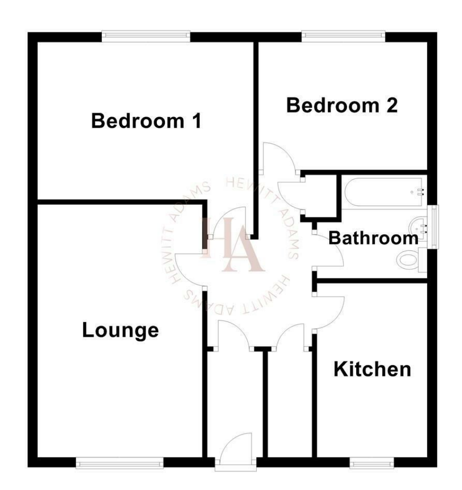
For illustration purposes only - not to scale