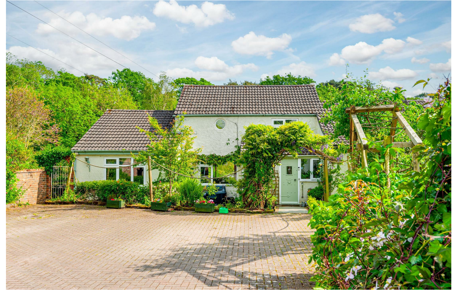
Thornton Common Road, Thornton Hough Total Approx. Floor Area 3737 Sq.ft. (347.2 Sq.M.)

Surveyed and drawn by Lena Media for illustrative purposes only. Not to scale. Whilst every attempt was made to ensure the accuracy of the floor plan, all measurements are approximate and no responsibility is taken for any error.