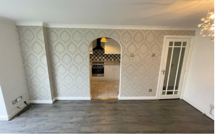
Ground Floor Approx. 53.1 sq. metres (571.2 sq. feet)