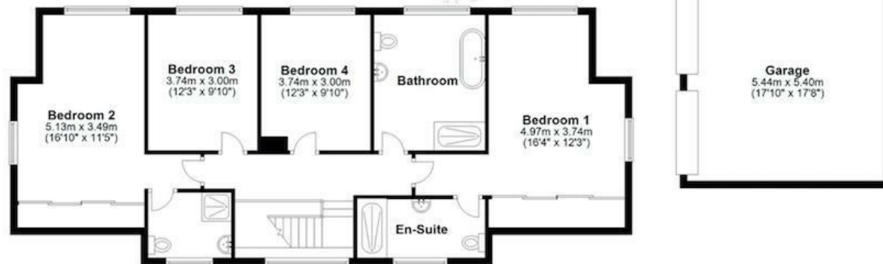
Total area: approx. 261.7 sq. metres (2816.7 sq. feet) For illustration purposes only - not to scale