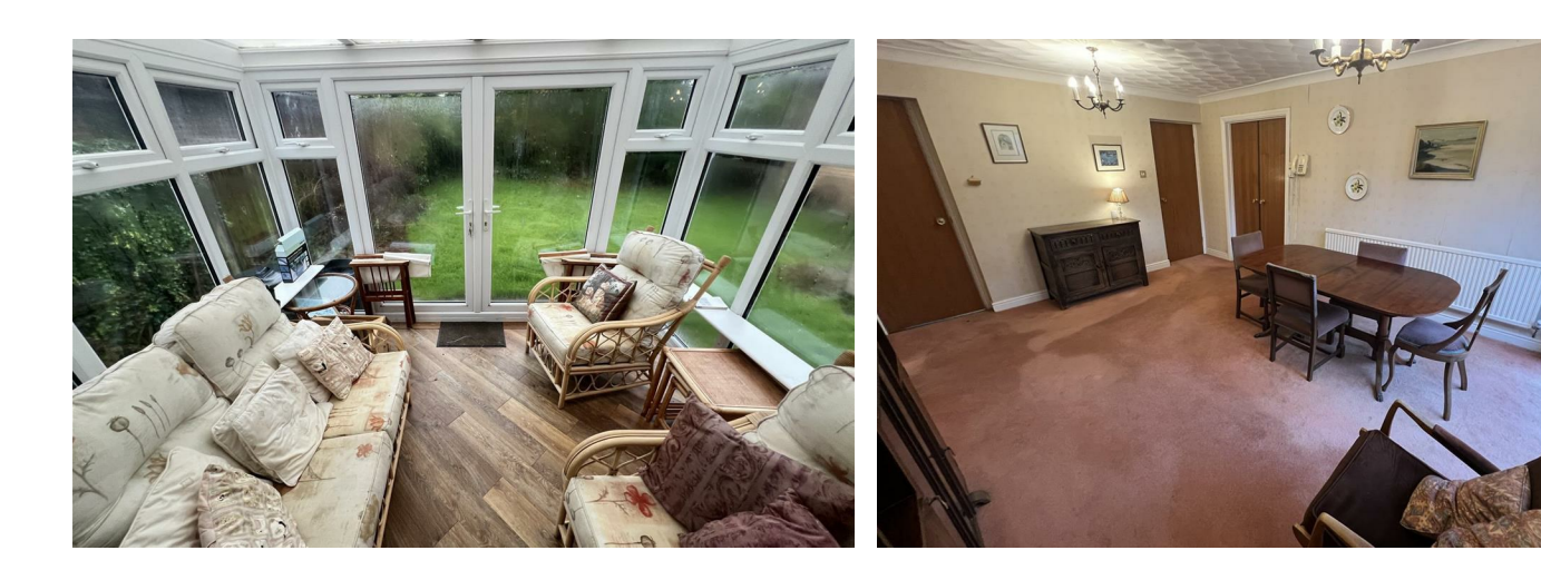
Ground Floor Approx. 109.8 sq. metres (1182.1 sq. feet)