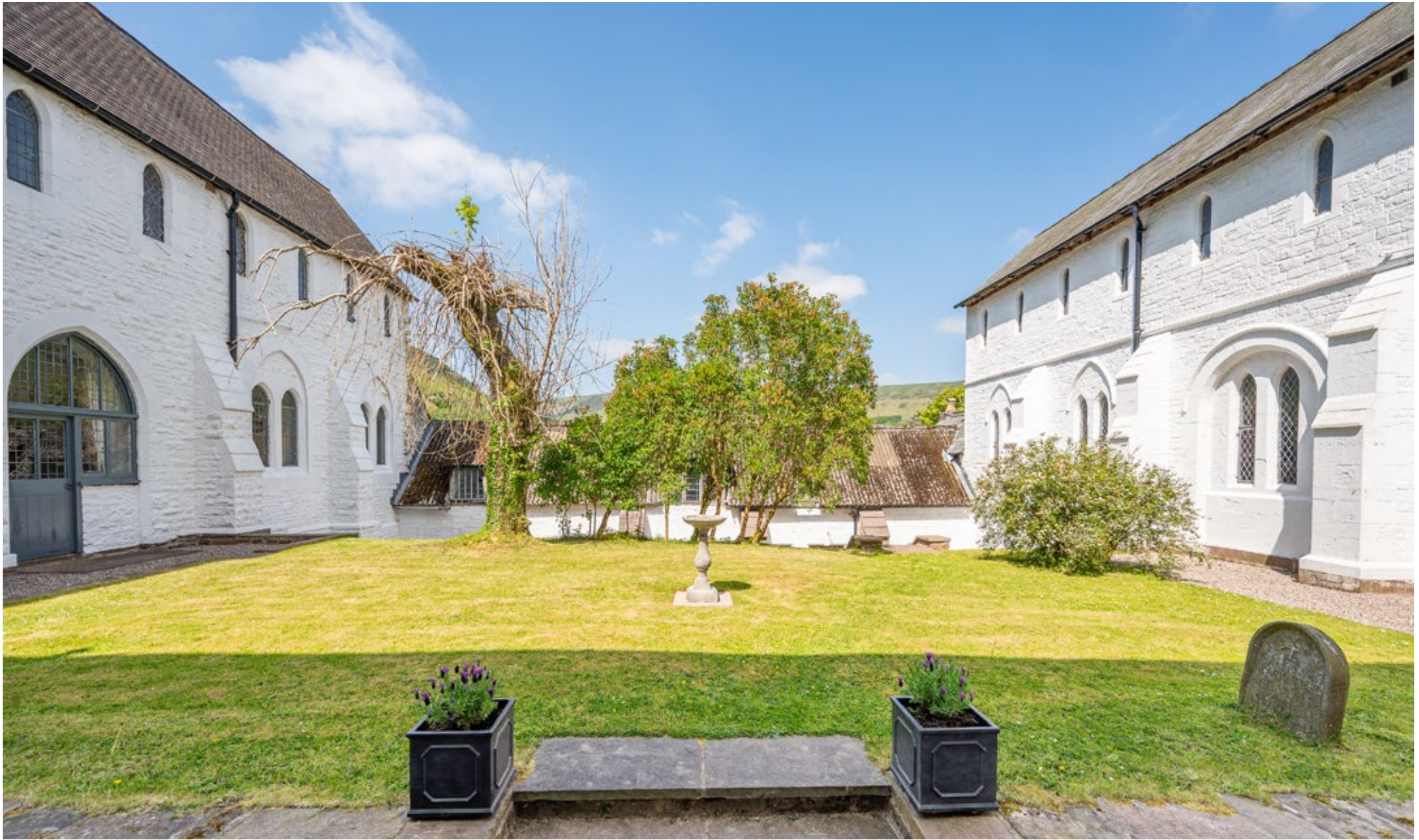
The Monastery Capel y Ffin | Abergavenny | Powys | NP7 7NP