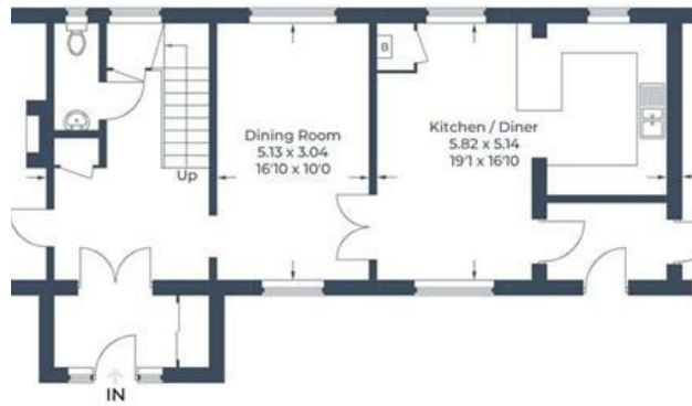
Illustration for identification purposes only, measurements are approximate, not to scale. © CJ Property Marketing Produced for Fine Homes Property