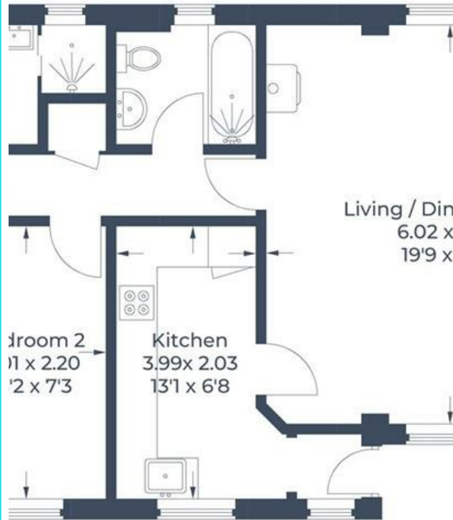
Illustration for identification purposes only, measurements are approximate, not to scale. © CJ Property Marketing Produced for Fine Homes Property

Approximate Gross Internal Area = 76.8 sq m / 827 sq ft