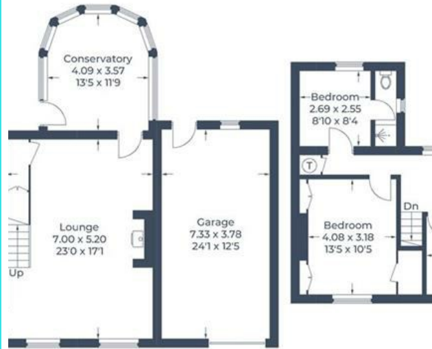
Illustration for identification purposes only, measurements are approximate, not to scale. © CJ Property Marketing Produced for Fine Homes Property

Approximate Gross Internal Area Ground Floor = 117.6 sq m / 1,266 sq ft First Floor = 88.9 sq m / 957 sq ft Garage = 28.1 sq m / 302 sq ft Total = 234.6 sq m / 2,525 sq ft