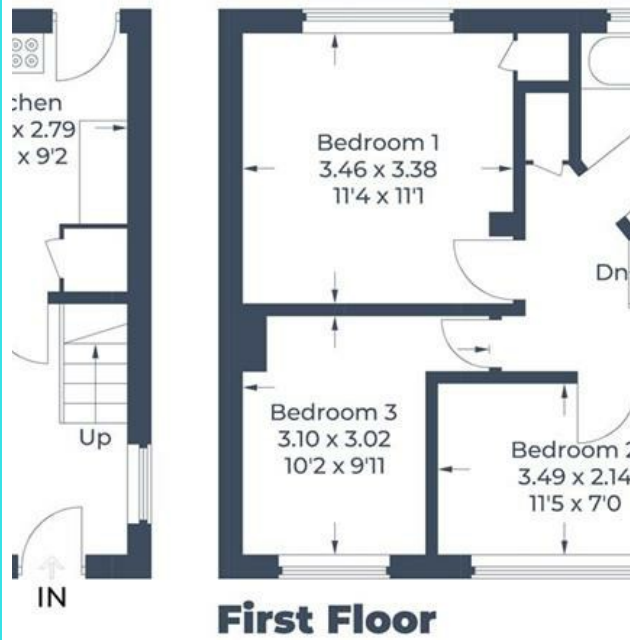
Illustration for identification purposes only, measurements are approximate, not to scale. © CJ Property Marketing Produced for Fine Homes

Approximate Gross Internal Area Ground Floor = 38.9 sq m / 419 sq ft First Floor = 38.6 sq m / 415 sq ft Cool Shed = 4.8 sq m / 52 sq ft Total = 82.3 sq m / 886 sq ft