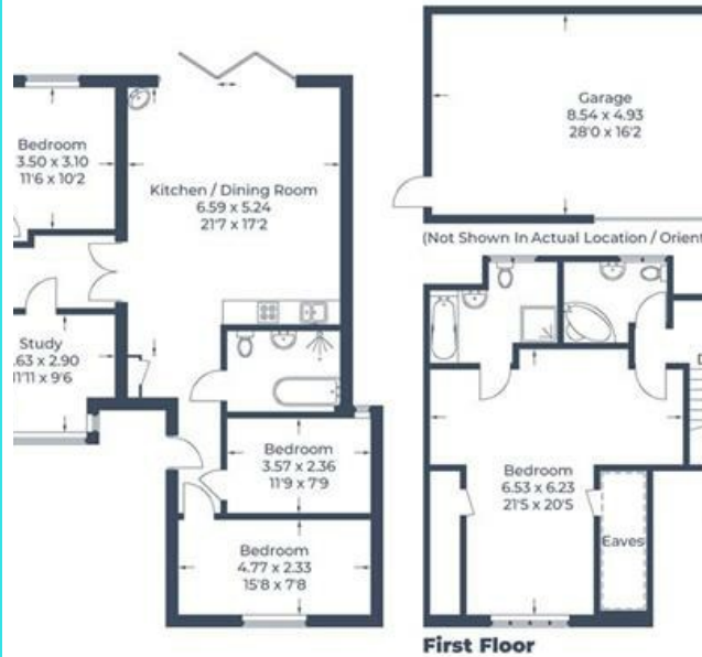
Illustration for identification purposes only, measurements are approximate, not to scale. © CJ Property Marketing Produced for Fine Homes Property

Approximate Gross Internal Area Ground Floor = 203.3 sq m / 2,188 sq ft First Floor = 91.3 sq m / 983 sq ft (Including Eaves) Garage = 42.3 sq m / 455 sq ft Total = 336.9 sq m / 3,626 sq ft