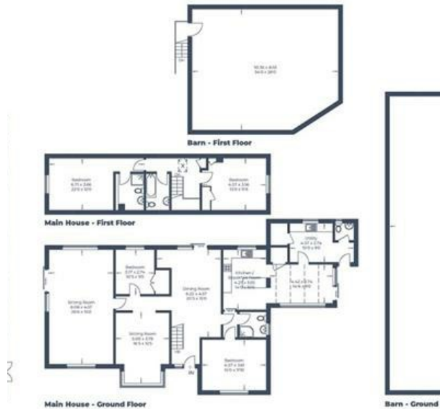
Illustration for identification purposes only, measurements are approximate, not to scale. © CJ Property Marketing Produced for Fine Homes Property

Approximate Gross Internal Area Main House - Ground Floor = 167.2 sq m / 1,800 sq ft Main House - First Floor = 56.0 sq m / 603 sq ft Barn - Ground Floor = 441.5 sq m / 4,752 sq ft Barn - First Floor = 85.2 sq m / 917 sq ft The Outback, Property Two = 223.8 sq m / 2,409 sq ft Total = 973.7 sq m / 10,481 sq ft