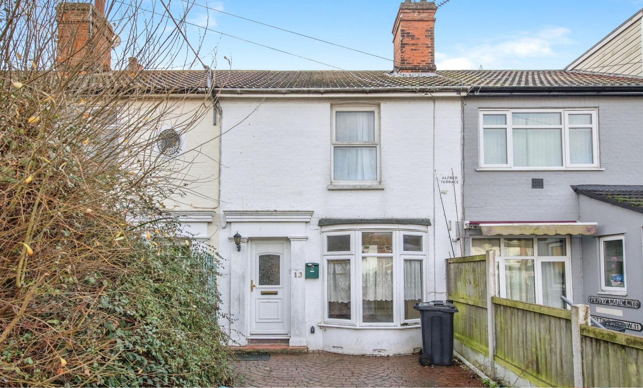
Alfred Terrace, Walton On The Naze CO14 8PD