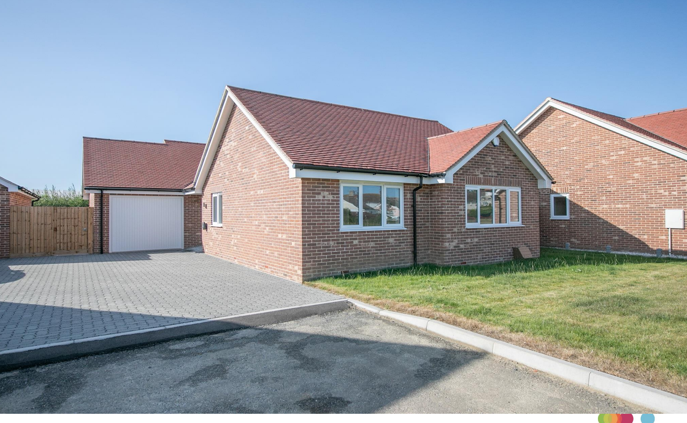
Nursery Field, Frinton Road, Thorpe-Le-Soken, Clacton-On-Sea CO16 0HS