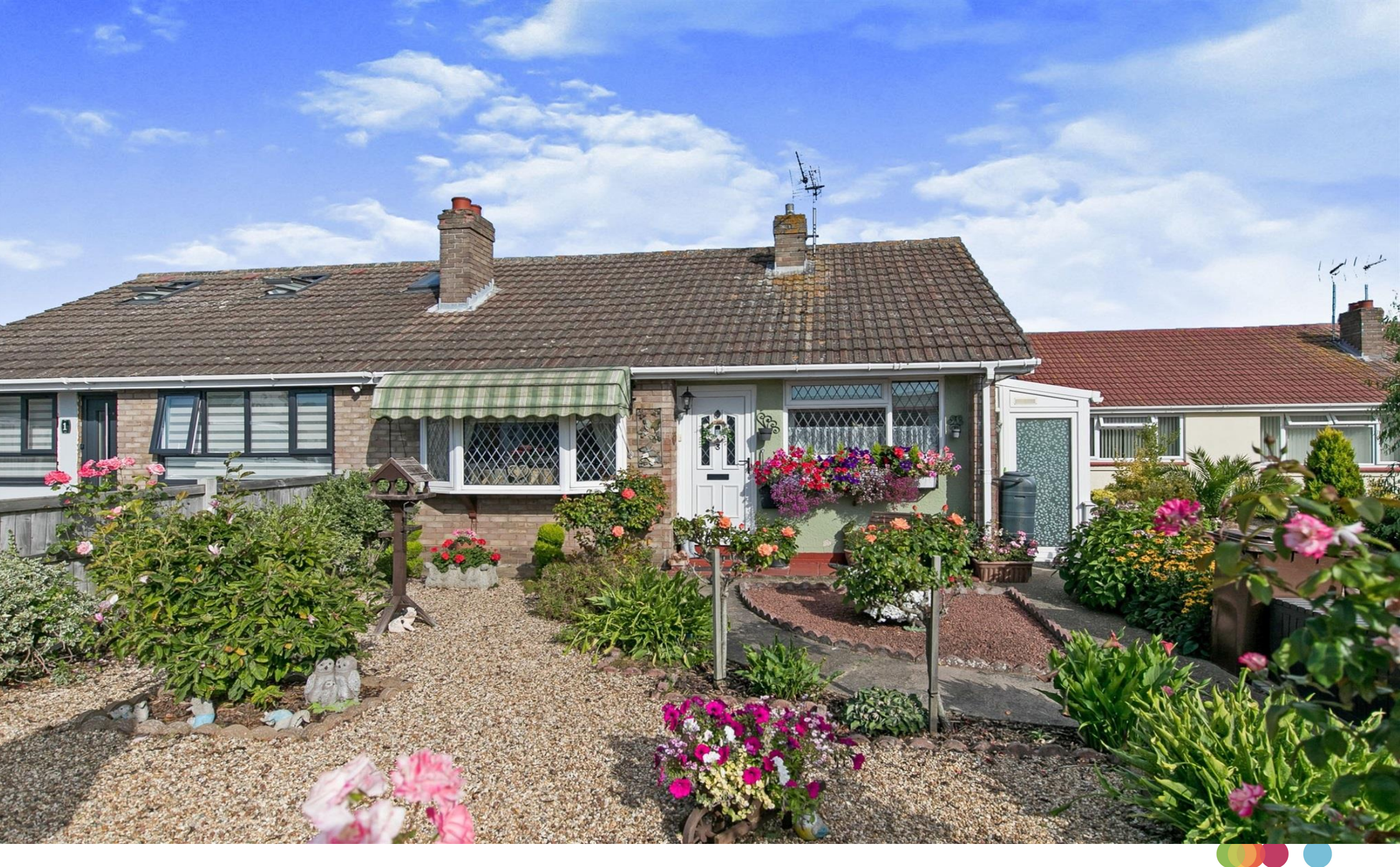
Bembridge Close, Clacton-On-Sea CO15 4QF